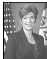
U.S. Senator Joni Ernst