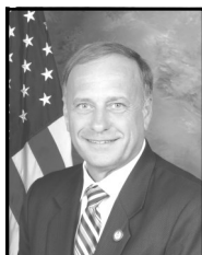
Congressman Steve King

Identifying and articulating long-term healthcare priorities will be the attraction during an Iowa Health Care Association Legislative Forum, scheduled to be hosted the afternoon of November 18 at The Highlands. The gathering of regional Iowa Health Care Association members is designed to allow area healthcare professionals the opportunity to share their personal healthcare insights with the following invited lawmakers, and/or their representatives, prior to the 2016 legislative session.