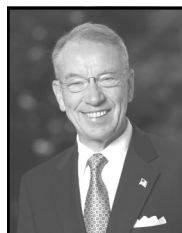
U.S. Senator Charles Grassley