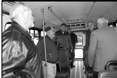
(Below) St. Luke Homes & Services board members view the new bus.