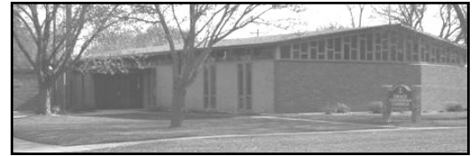
Grace Lutheran Church 380 N. Rerick Avenue, Primghar (712) 957-4795