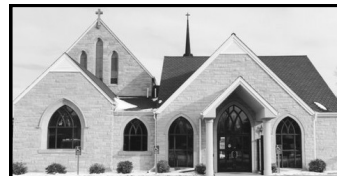
St. Paul's Lutheran Church 60 N. Central Avenue, Hartley (712) 728-2711 www.stpaullutheranhartley.com/